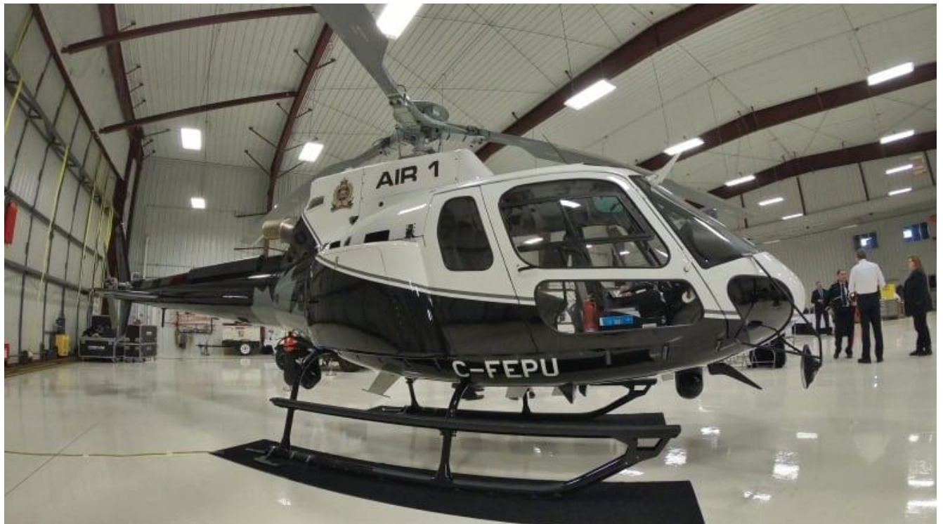
The new Air One