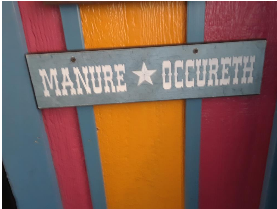
Some local humour in Paysan, Arizona, November 2019