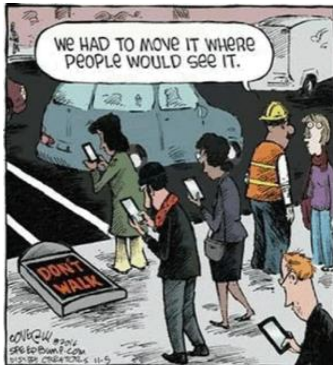
The GYROLOG January 2020