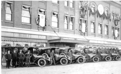
Hudson's Bay Building