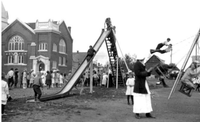
Playground No. 1 Patricia Park