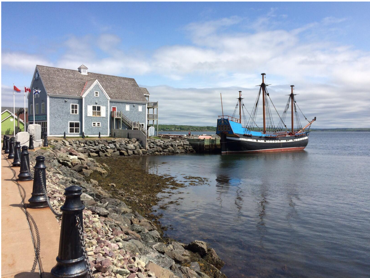
Ship Hector Replica-Pictou, Nova Scotia