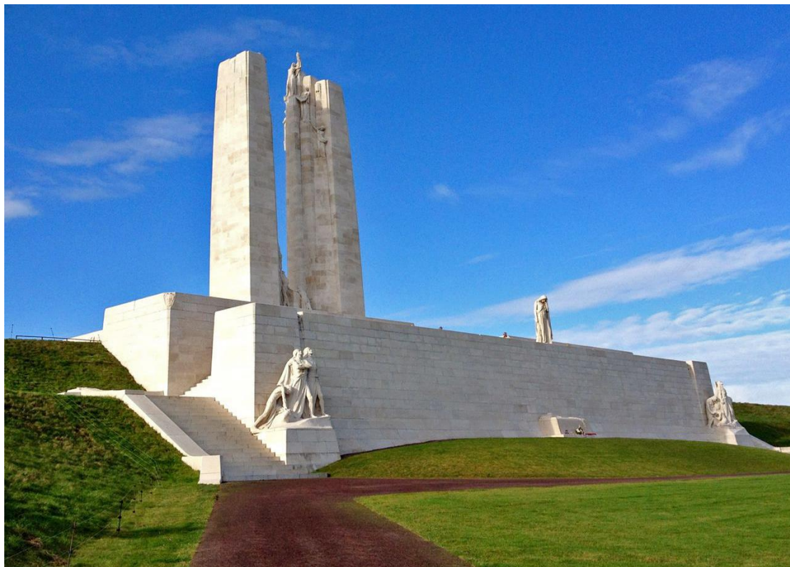
Vimy Ridge Memorial