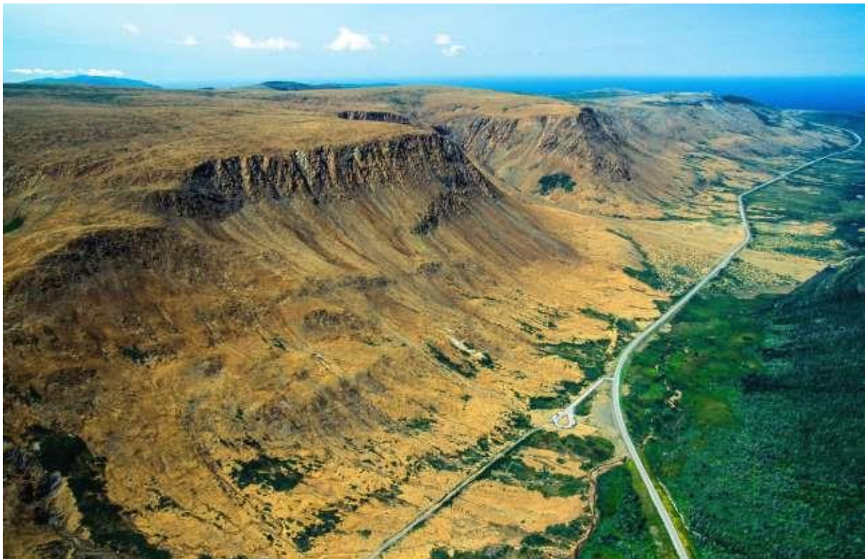
Head Smashed-In Buffalo Jump, Southern Alberta