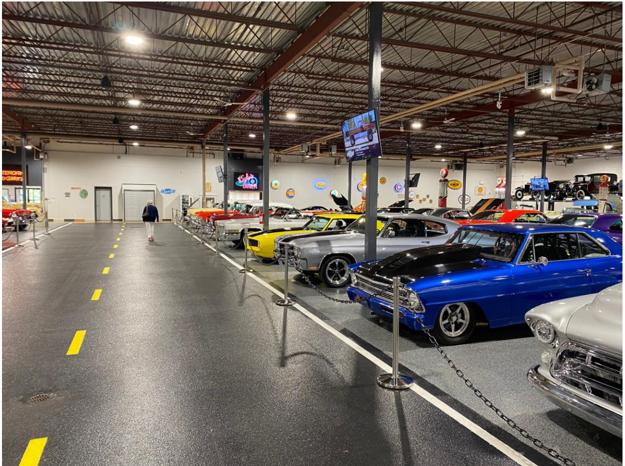
Yesterdays Auto Gallery Muscle Cars

For more information on the auto gallery check the website: www.yesterdaysauto.ca