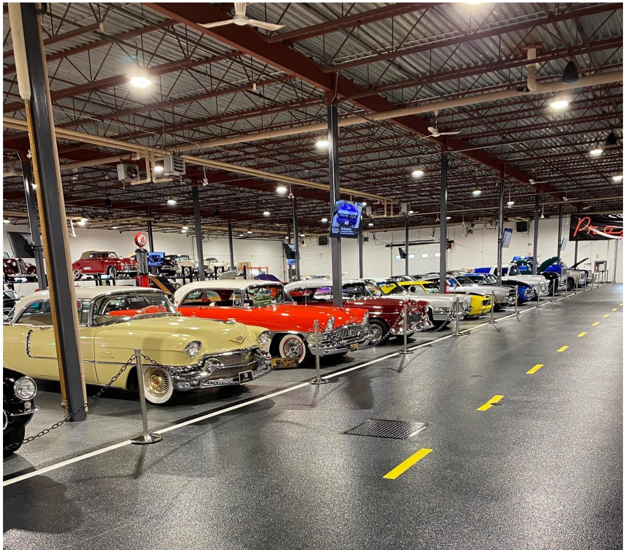
Yesterdays Auto Gallery 1920's -1950's