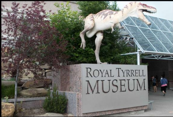
A World-Class Exposition!