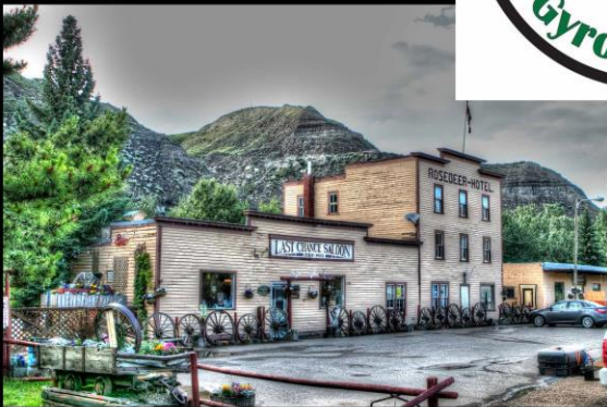
Last Chance Saloon - Yahoo!