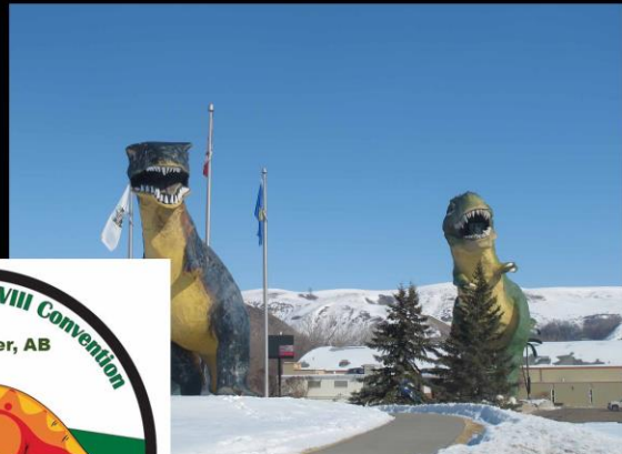
Roar with the Gyros!