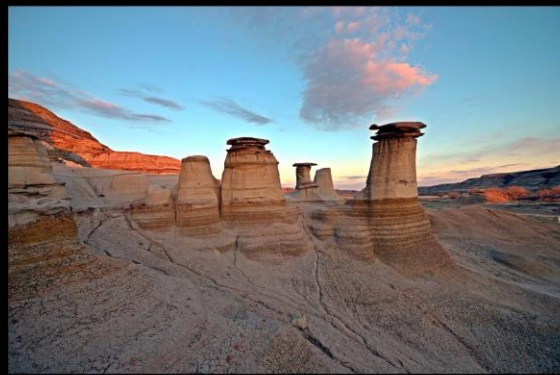
Hoo Doos and Badlands!