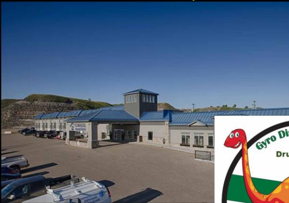
No Hassle Facilities