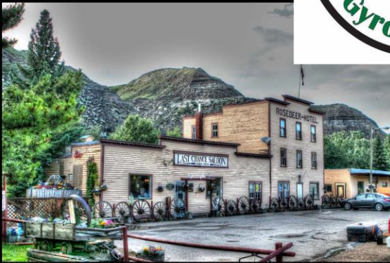
Last Chance Saloon - Yahoo!