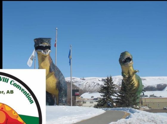
Roar with the Gyros!