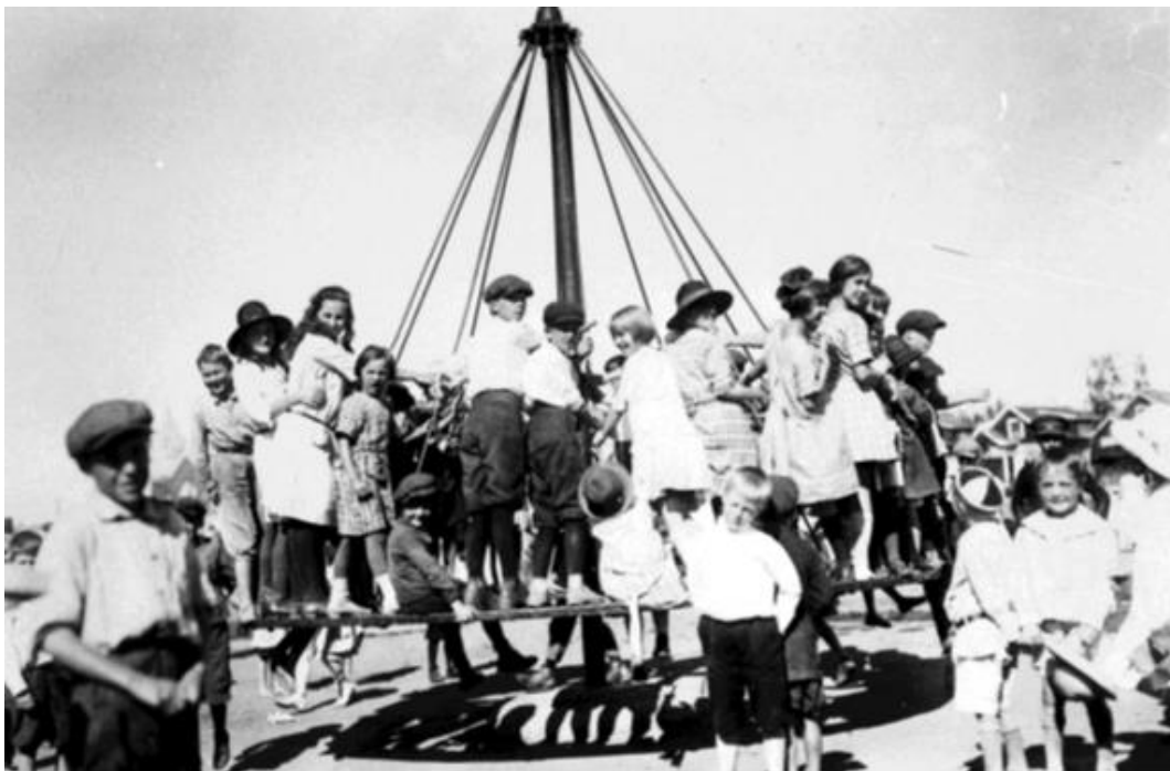
Merry Go-Around in Tipton Park Gyro Playground No. 3

Apparently in 1900 only the strong survived recess