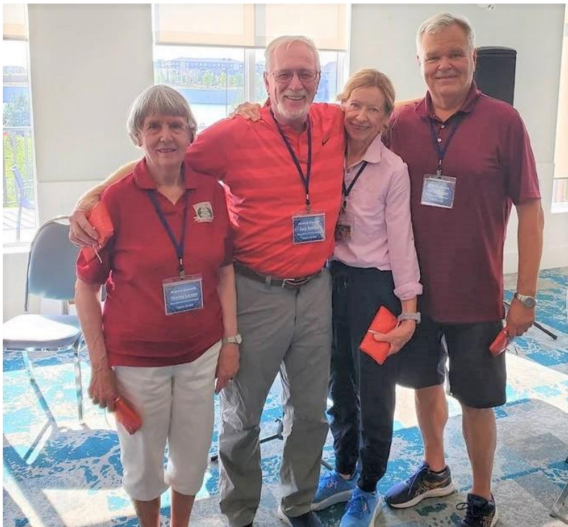
Group "B" Bocce Winners