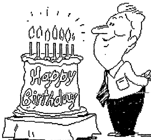
THE BIG 90 FOR STEWART GRAHAM!!