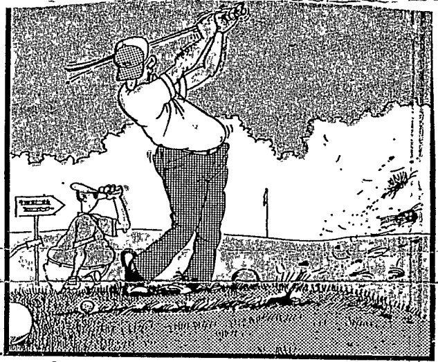
A grassroots approach suits you to a tee.