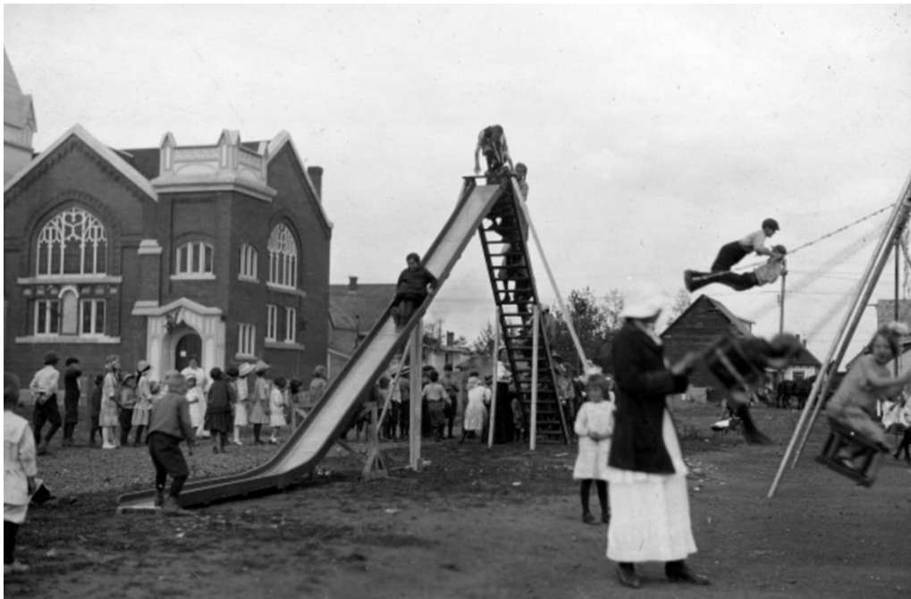
Gyro Playground No. 1 Patricia Square 1922

Apparently in 1900 only the strong survived recess