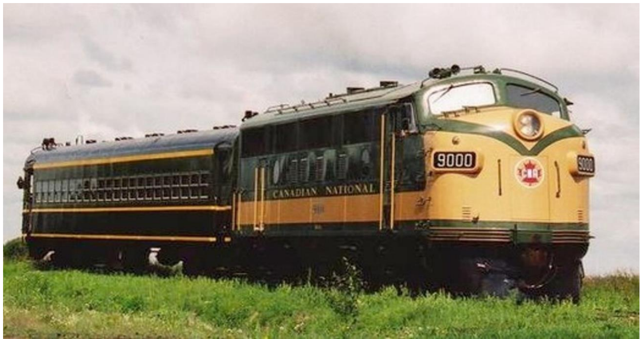
GM Diesel-Electric Locomotive, First CNR Mainline Diesel #9000 Built in La Grange, Illinois, May 1948, Retired October, 1971