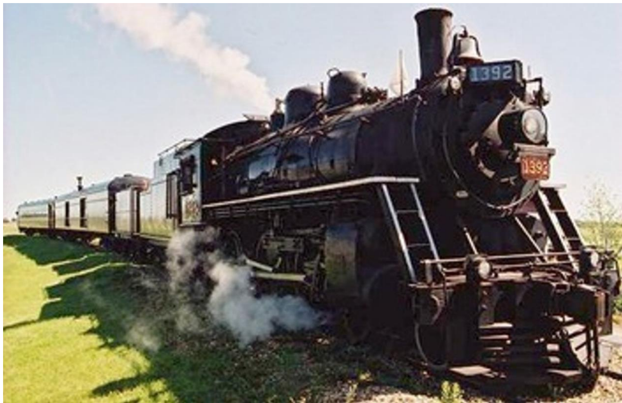
CN Steam Engine 1392, Built by Locomotive Works, Montreal, 1913 Retired 1955