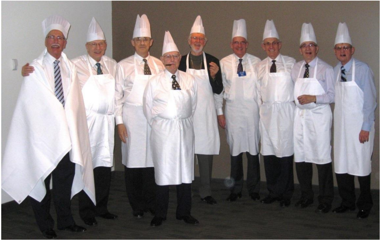
The Turkey Carvers