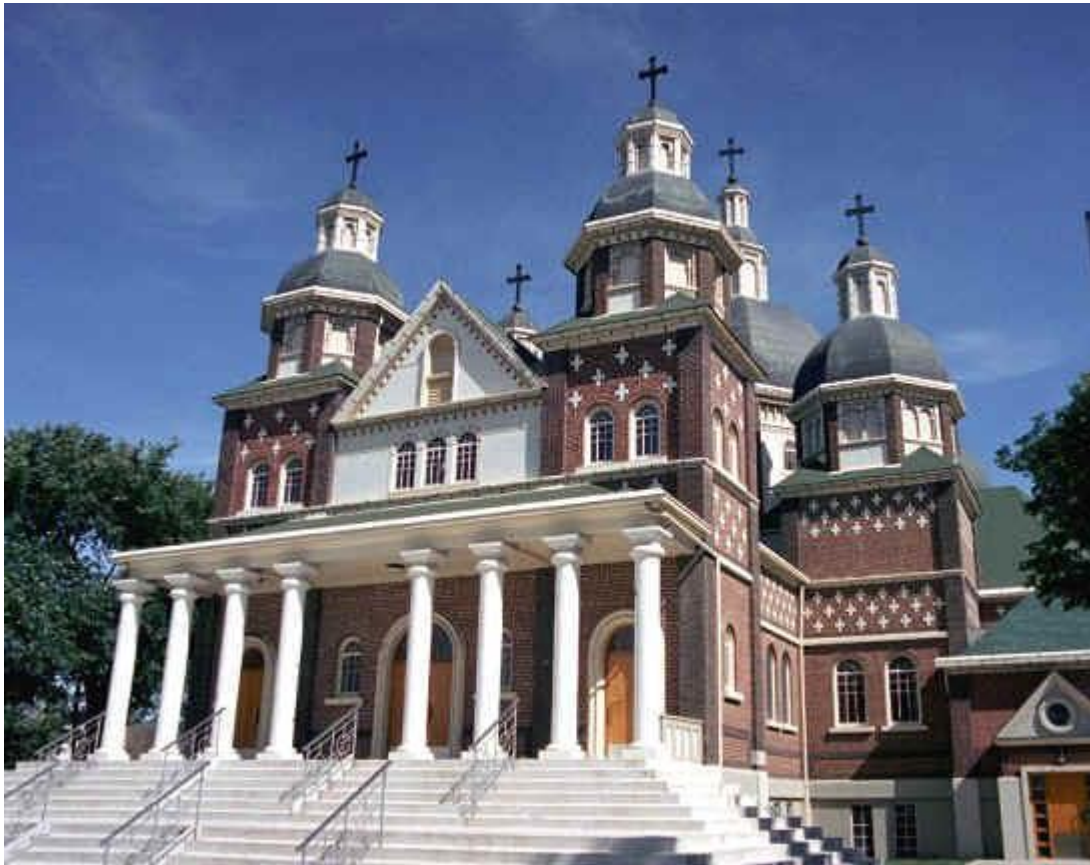
St. Josaphat Ukrainian Catholic Cathedral